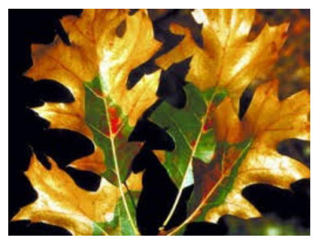
One of the many plant disease samples brought into the Extension office for identification.