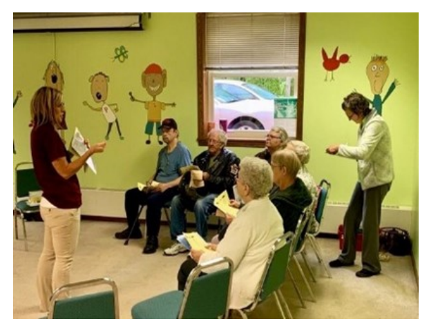
Seniors in Newaygo County Participate in Project Fresh nutrition education.

MSU Extension recognizes the importance of strong support to seniors in Newaygo County. 624 seniors received nutrition education as part of the Project Fresh initiative. Powerful Tools for Caregivers provided training designed to help caregivers take care of themselves, learning a range of self-care tools to help reduce personal stress and communicate effectively with family members and healthcare providers. Dining with Diabetes and Chronic Pain management sessions were also provided in Newaygo County.