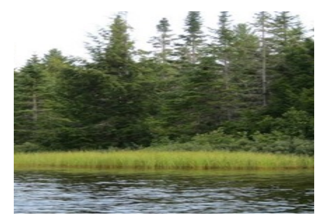
Research on inland lakes in Newaygo County provides data for statewide reports.

MSU Extension's focus on lakes, streams, and watersheds brings together educators and researchers with local, state, regional, and federal agencies and stakeholder organizations to protect and promote the sustainable use of the state's distinctive aquatic resources. In 2019 in Newaygo County, projects included invasive species identification, herbicide research, shoreline preservation, and more.