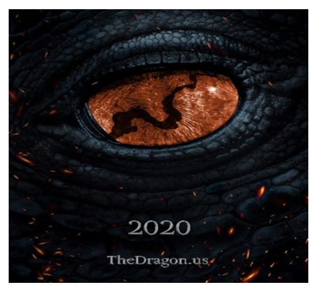
Development of the Dragon Trail will further establish Newaygo County as a destination spot for eco-tourism.