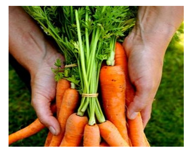
Kids learn to make healthy snacks during

MSU Extension's Supplemental Nutrition Assistance Program (SNAP-ED) provides basic nutrition education and hands-on activities for all ages. Core curricula are designed to help lowincome families stretch their food dollars while maintaining good nutrition. Some instruction includes physical activity and cooking techniques that help instill life-long skills. It is estimated that every $1 spent on nutrition education saves as much as $10 in long-term health costs. In Newaygo County over 1,200 residents participated in this programming.