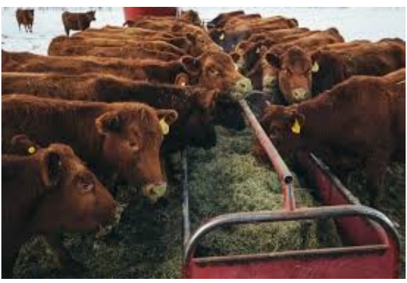
Beef and dairy farms benefitted from consultation visits from MSU Extension educators

Providing support to dairy and beef farms in Newaygo County resulted in improved quality of livestock, savings on investment in feed, and time-saving efficiencies, all of which result in better financial performance. Other farm visits in Newaygo County focused on succession planning with farm financial analysis, Farm Bill education sessions, and Farm Stress consultations.